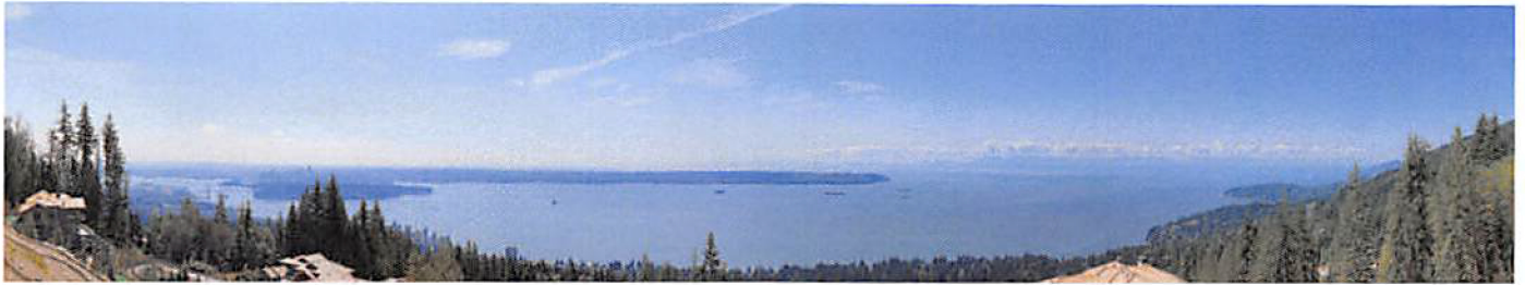
VIEW FROM UNIT C LEVEL 4 WEST BUILDING